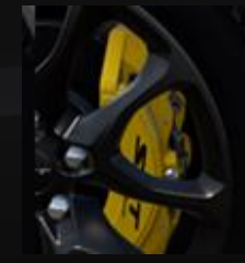
Yellow Brake Calipers (XTL)