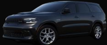
PITCH BLACK (PX8)