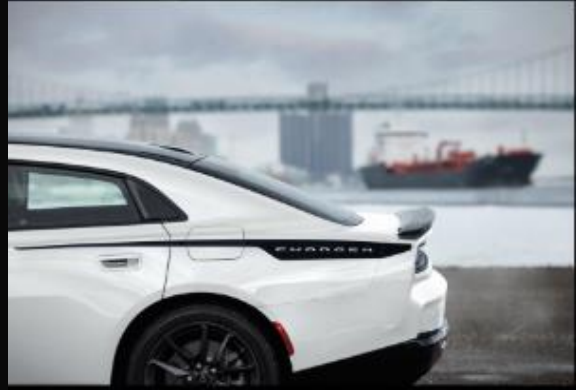
Red Strobe Stripe Q2 2026 $750 (M2P)