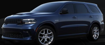
NIGHT MOVES (PCQ)