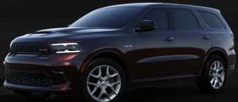
RED OXIDE (PHC)