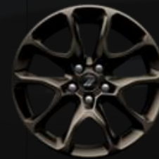
20x10-Inch Brass Monkey (WSG)