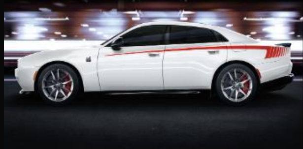
Red Charger Stripe Q2 2026 $725 (M22)