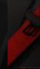
Red Seatbelts (CGQ)