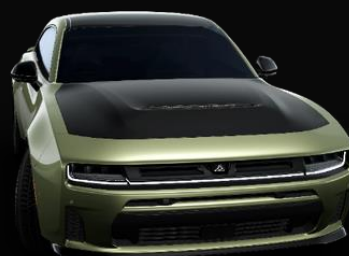
Satin Black Painted Hood ICE Only $1,995 (MYW)