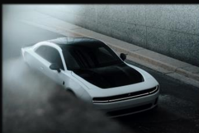
Gloss Black Painted Hood BEV Only $3,250 (MYZ)