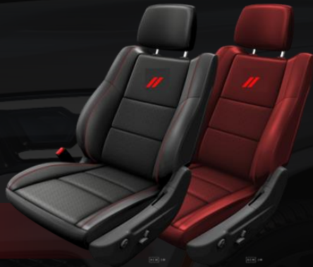
*ML – Nappa Leather 7-Passenger (6-Passenger Optional) Standard on Plus/Premium