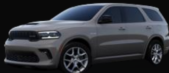
DESTROYER GREY (PDN)