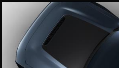
Black Hood Patch ICE only $395 (MXJ)