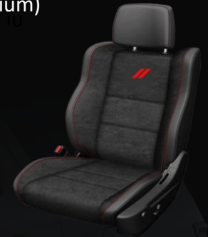
*T5 – Leather Suede 6-Passenger SRT Bolster (Part of Blacktop Redline Package on PLUS/PREMIUM)