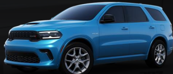
B5 BLUE (PQD)