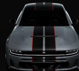
Dual Fratzog Stripes ICE and BEV $1,695 (MPE)