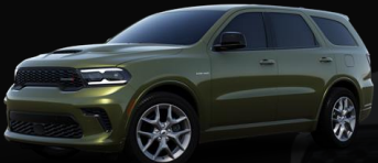
GREEN MACHINE (PFP)