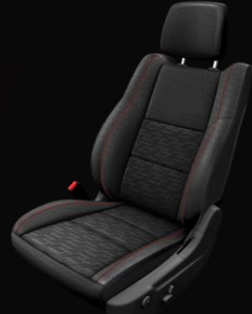
*C5 Cloth 7-Passenger Standard on Base