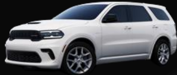
WHITE KNUCKLE (PW7)